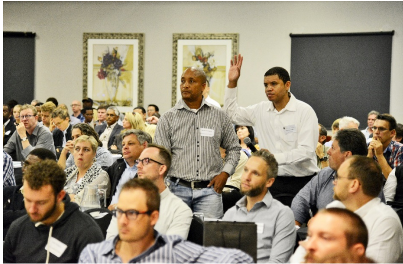
Figure 1 Members of the profession engage with SACAP at the Stakeholders Engagement and Public Participation Forum held at Birchwood Hotel on 10 March 2016

I'd like to take this opportunity to outline the protocols that we as a regulator and public protector adhere to, for the sake of good governance.