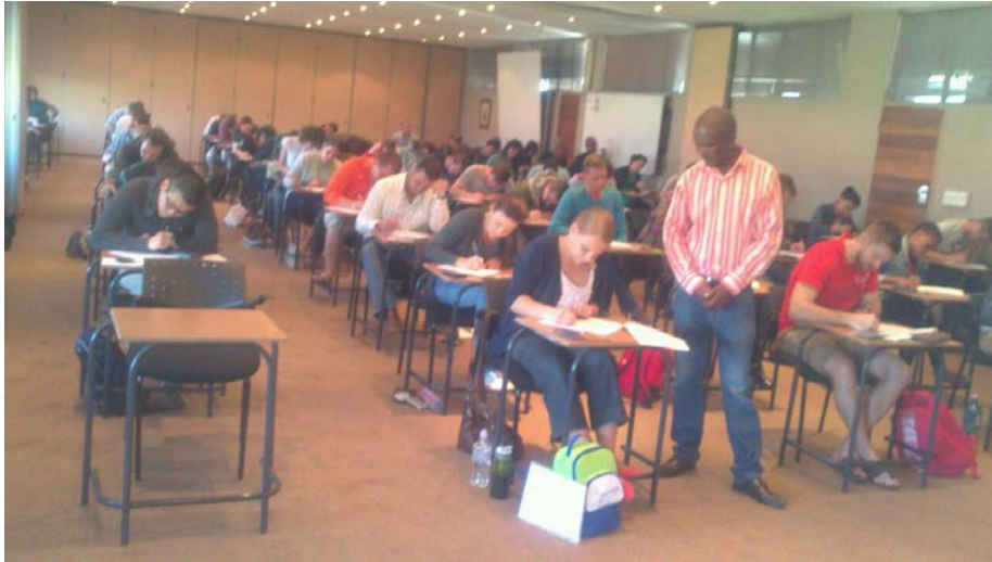
Figure 4 Candidates write their PPE in Pretoria on 20 April 2016

And last but in no way least, we are encouraged to see that there are now three new Voluntary Associations (VA's) looking to us for recognition. VAs have an important role to play in the implementation of CPD in that they can offer Category one activities, as well as validate and monitor activities offered (in Category one only) by other providers. We'll soon be communicating the date of the next VA Forum meeting.