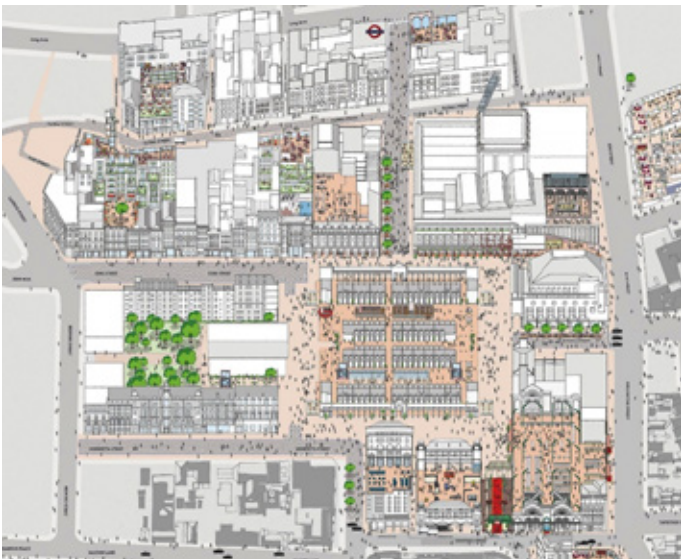
Covent Gardens, London, UK, Urban Transformation, Render

The Covid pandemic has introduced a new debate, the “post-Covid” future of cities. With the reality of “hybrid lifestyles”, work from home concepts, and the home office the debate is shifting, with the city finding a new definition towards the life, work and play concepts. It is becoming apparent, that the monocultural office buildings in the inner city will need to be reconsidered. Post Covid, it has to be recognised, that life in the inner cities is changing, with the economic pressures contributing to the change in living, working, and spending patterns. Some businesses have not been able to recover from the impact of Covid and others had to reinvent themselves. In the global North, where city life is the main urban playground characterised by integrated commercial, retail, residential, and social environments, some inner cities are faced with challenges of economic viability