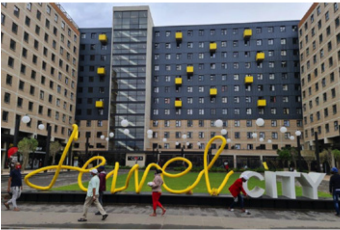
Jewel City, JHB

The urban strategy we developed for the inner city precinct in Jhb in 2021 was a result of the establishment of an advisory panel of various experts in the built environment, property experts, historians, social activists and the corporate sector, calling for a multi-stakeholder platform which would include other corporate stakeholders, the City, Gauteng Province, civil society, the taxi industry etc to participate and drive the revitalisation initiative. This initiative did not succeed due to the economic and investment climate at the time, and more concerning, the difficulty to get the multi-stakeholder platform off the ground.