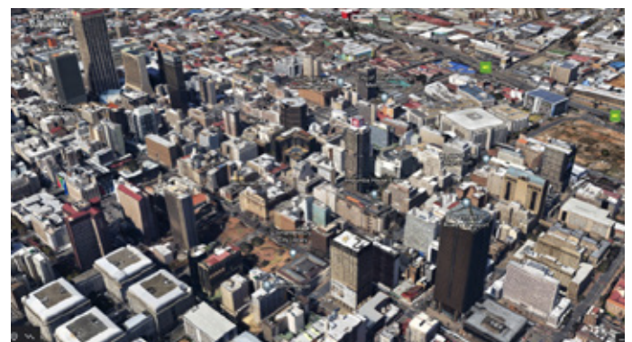
JHB CBD, Google Maps

In the course of 2021 and 2022 I was part of an initiative exploring the urban regeneration and revitalisation of a precinct in the inner City of Johannesburg.