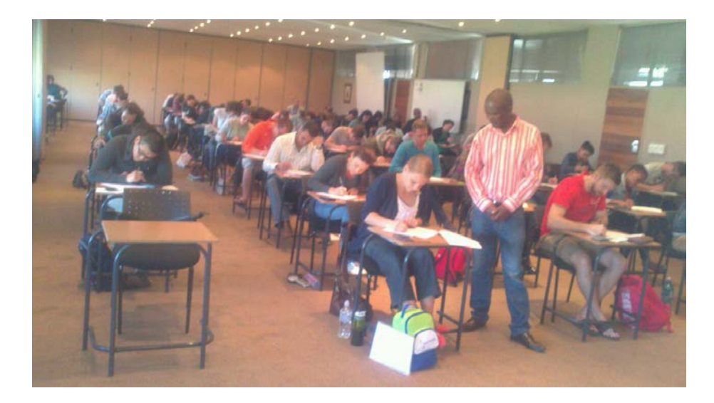
Figure 4 Candidates write their PPE in Pretoria on 20 April 2016

And last but in no way least, we are encouraged to see that there are now three new Voluntary Associations (VA's) looking to us for recognition. VAs have an important role to play in the implementation of CPD in that they can offer Category one activities, as well as validate and monitor activities offered (in Category one only) by other providers. We'll soon be communicating the date of the next VA Forum meeting.