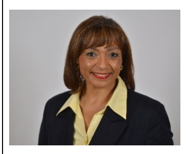
SACAP E- Newsletter - April 2016 From the desk of the Registrar – Edition : 03/2016

Tel: + 27 11 479 5000 Fax: + 27 11 479 5100 Email: <u>info@sacapsa.com</u> Website: www.sacapsa.com