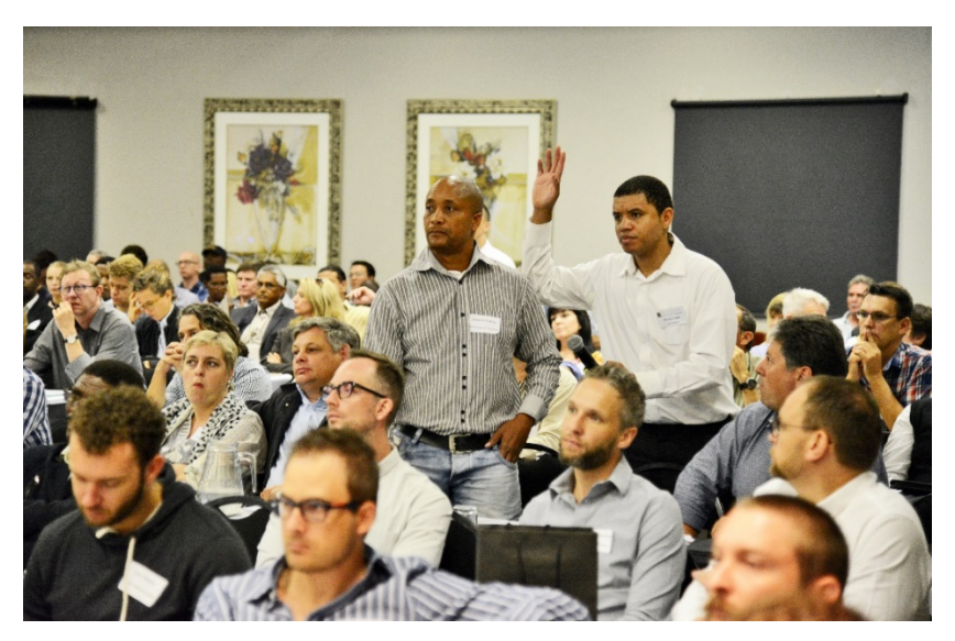
Figure 1 Members of the profession engage with SACAP at the Stakeholders Engagement and Public Participation Forum held at Birchwood Hotel on 10 March 2016

I'd like to take this opportunity to outline the protocols that we as a regulator and public protector adhere to, for the sake of good governance.